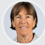
Head Coach Tara VanDerveer

Stanford Tennis. Coached his teams to 17 NCAA Team Championships and 13 former players hold 70 Grand Slam championship titles.